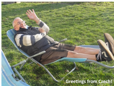
Greetings from Czech!

I'd like to share a nice, little story with you - one of our Czech sisters has been quite sick and needed to stay in quite extreme isolation. So an older brother rang her and sang to her for an hour on the phone, to encourage her and uplift her. This brother doesn't have any technology or the internet at home, so it's difficult to connect to our current online meetings, but he found a special way to help in this situation. It showed us that each of us can be useful and encouraging, even in seemingly small ways.