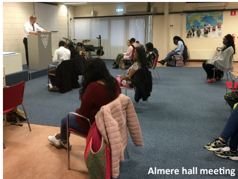
Almere hall meeting