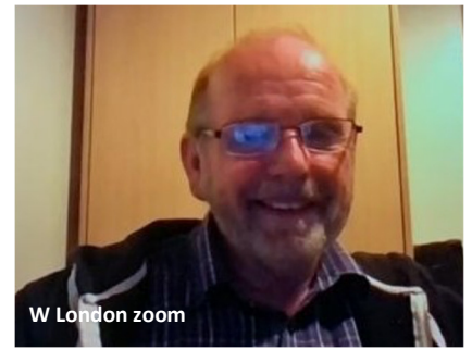
W London zoom

because there is just so much to learn and discover and even when we read the same things over and over again, they never lose their meaning and power.