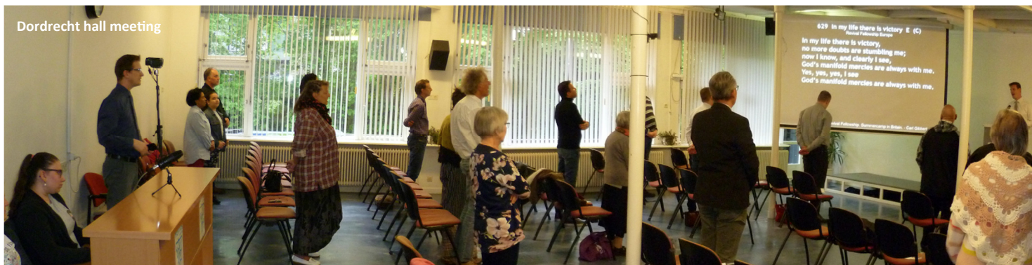
Dordrecht hall meeting

Several Czech saints have been joining the regular Medway morning online fellowship sessions, and so we also started sharing scriptures online, two evenings per week.