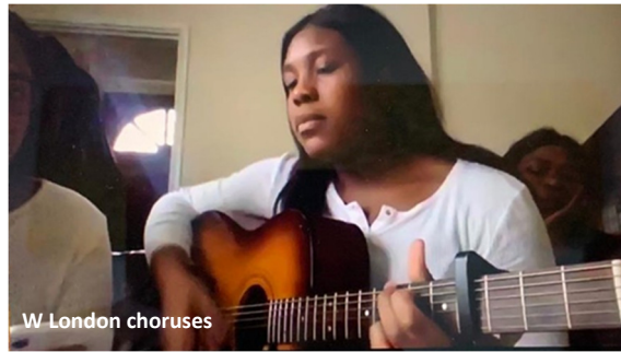
W London choruses