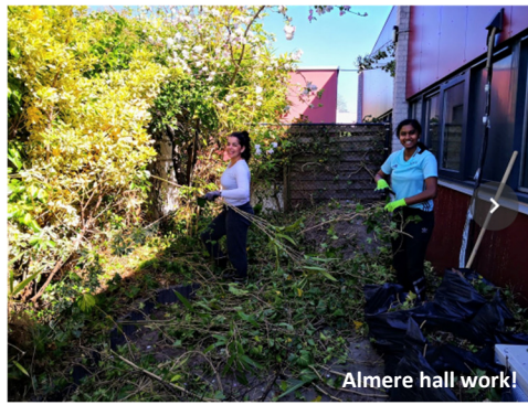
Almere hall work!

Staying connected, despite the physical distance. God bless!