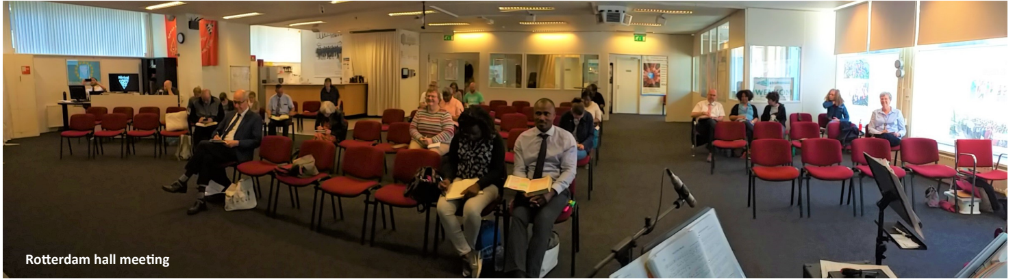
Rotterdam hall meeting

testimony of the Lord showing I am trustworthy.