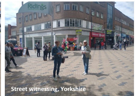
Street witnessing, Yorkshire