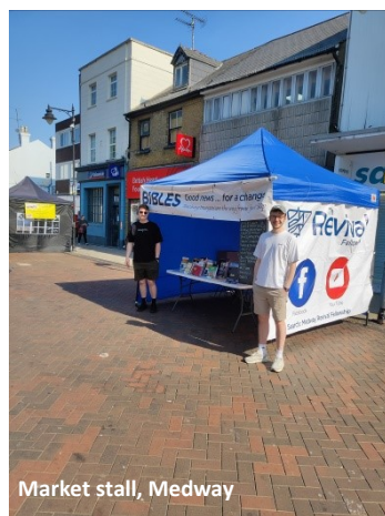
Market stall, Medway