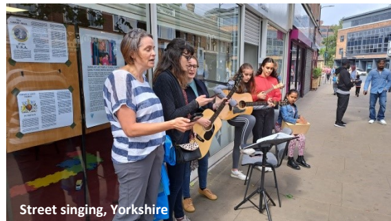
Street singing, Yorkshire