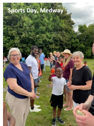
Sports Day, Medway