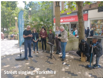
Street singing, Yorkshire

Last Saturday we held an outreach here in Wakefield and were supported by several car loads of saints from Liverpool. It was a great day – we had groups of singers out in the street, people stopped to listen and were witnessed to, others came into the meeting place where Bibles were opened, some were prayed for, contacts were exchanged, a lot of food was eaten - great fellowship.