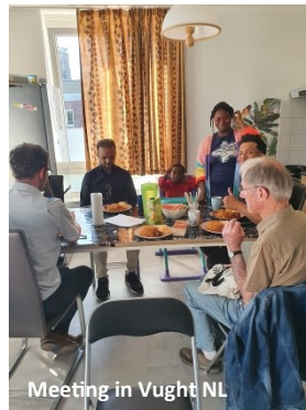
Meeting in Vught NL