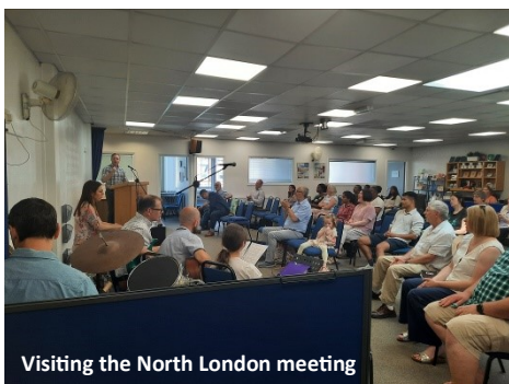
Visiting the North London meeting

We are very much looking forward to seeing you all at our summer camp soon!