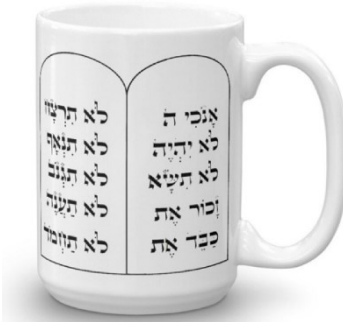
The 10 commandments in Hebrew on a coffee mug

Animals do not have this ability. Only creatures made in the image of God have this!