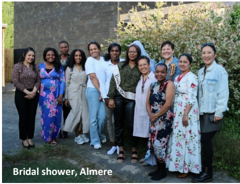
Bridal shower, Almere