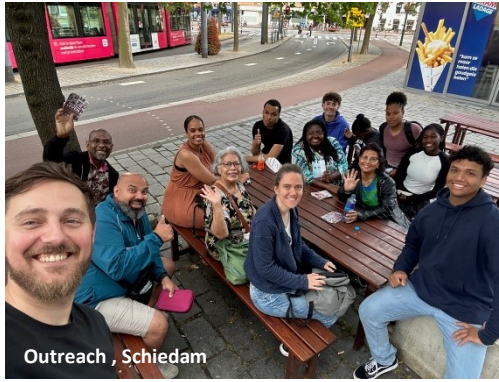
Outreach , Schiedam