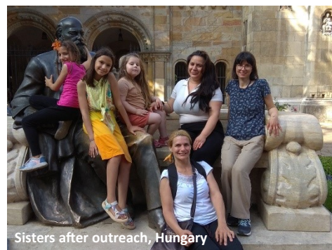
Sisters after outreach, Hungary

In June we saw two brethren making it back to fellowship through repentance, both very enthusiastic in the Lord now. One is a young man who got born again and then left at the age of 8 with his parents. He's been through the world in his teenager years, almost died of a drug overdose then repented and contacted us. After 13 years in the world, he's now eager to learn the ways of the Lord and brought two friends who got baptised