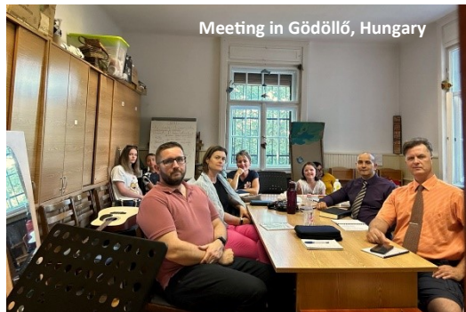
Meeting in Gödöllő, Hungary

and Spirit filled. We also baptised a third man in June. Wednesday meetings continue in Lajosmizse while East of Budapest the saints had to look for a new place and settled for the town of Gödöllő where they found the perfect hall which was made available for them for free!