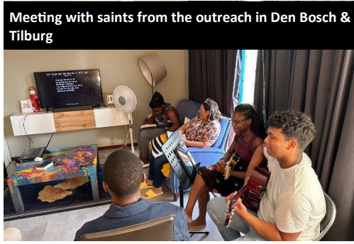
Meeting with saints from the outreach in Den Bosch & Tilburg