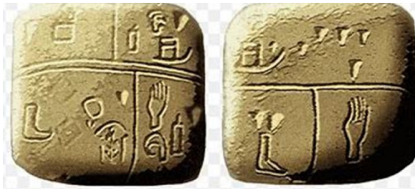
The Kish tablets, approx 5,500 year old early writing

And so, the written words became a 'teaching' development and with this the ability to communicate right across time, places and nations. And communicating Ideas, concepts, influencing, spreading knowledge etc. etc... And that is where mankind is unique.