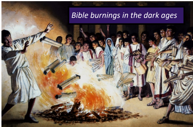
Bible burnings in the dark ages

And that is why this ability has been targeted by the opponents of Gods plan.