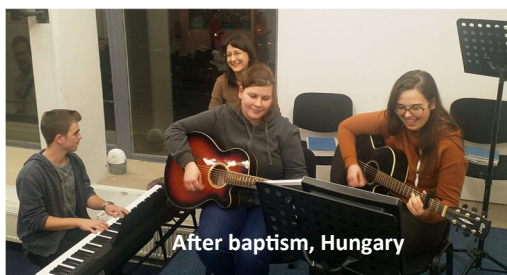
After baptism, Hungary

We had our last baptism in the hall as we are moving out. This will lead to another great chapter in the work of the Lord.