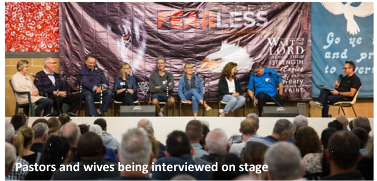
Pastors and wives being interviewed on stage