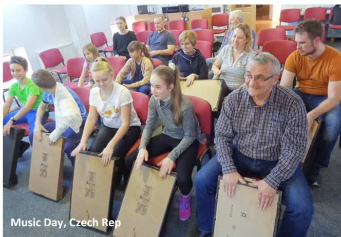
Music Day, Czech Rep

A big highlight of March was our Music Day, where we invited many guests. Two new families visited our event and fully enjoyed themselves. The music day was designed to give the children/adults an opportunity to try many different musical instruments, with the help of more experienced players. We started by learning how to make various rhythms on make-shift cajons, made from fruit boxes from the supermarket. They were a great hit! Then we broke up into smaller workshops and practised 2 songs on various instruments. To finish, each workshop got up on the stage and showed what they had achieved in a short time - there were impressive results, seeing that it was the first time for many people to