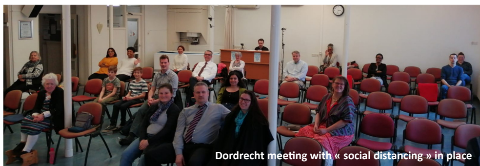
Dordrecht meeting with « social distancing » in place